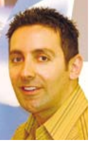
CEO and Founder of the Financial Freedom Institute (FFI)

In an age with so many distractions vying for our attention, simply by reading this introduction to a timeless work of wisdom, you are demonstrating your commitment to take the next inaugural step in setting yourself apart from the masses. No matter what a person's status or level of achievement in society, those who have reached a pinnacle of success in life do not rest on their laurels. No person can become so astute in any mental faculty of thinking, that they are not able to further raise their level of awareness. The universe cannot put good into your hand until you let go of what you are holding in it. The most powerful prosperity tool is wisdom and by increasing it, your wisdom will always manifest a corresponding increase in wealth. Hence, we are born to evolve and thrive on change in order to harness new energies and opportunities.